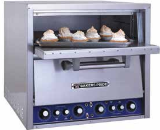
DP-2 Interior lights are standard—shown with optional infinite top & bottom heat controls

Optional features include top and bottom heat control for perfectly balanced results for nearly every menu item.