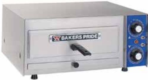
PX-14 12 1/2" x 14" chrome-plated wire, slide-out baking rack