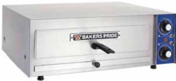
PX-16 17" x 17 1/8" chrome-plated wire, slide-out baking rack

BAKERS PRIDE PX Series Mini HearthBake Ovens are ideal for pretzels, cookies, parbaked products, finishing, warming, hot wings and more.