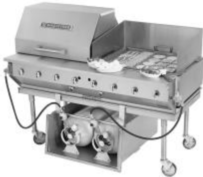
CBBQ-60-CP with Optional 30" in-line griddle & wind guard