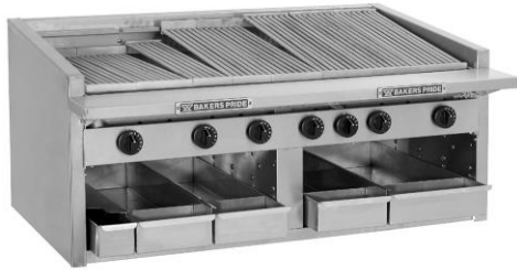
Model C-48R with floating rod top grates