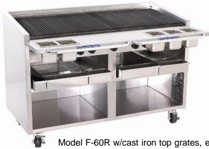
Model F-60R w/cast iron top grates, extra-wide work deck, pan cut-outs and casters (optional)